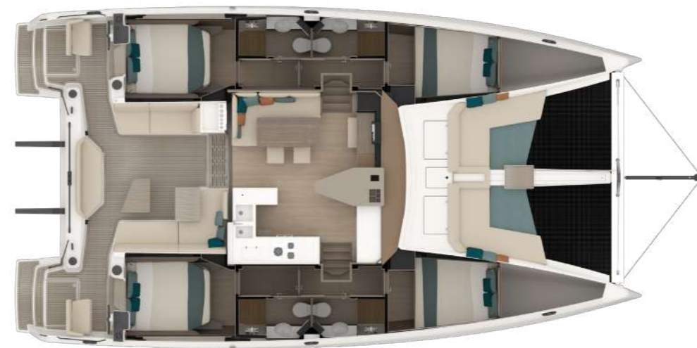
4 cabins, 4 heads