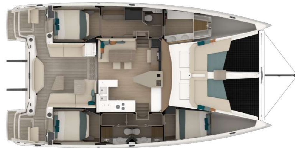
3 cabins, 3 heads, owner suite