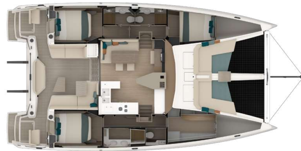
3 cabins, 3 heads + SmartRoom® FLEXIBILITY